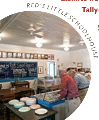
RED'S LITTLE SCHOOLHOUSE

The Gift Horse Apple Cheese Casserole 251-943-3663