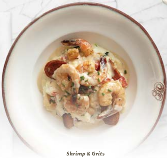
Shrimp & Grits Classic on Noble - Anniston